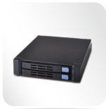
1 x 3.5" bay for FDD or SK51201