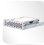
1 x 3.5" Internal bays for 2.5" HDD