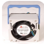
Optional 4 x middle hot-swap fans