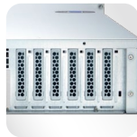
Changeable low profile rear window