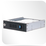
1 x 5.25" bay for ODD or SK31101