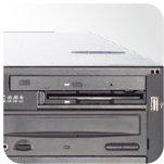
Slim ODD + Slim FDD