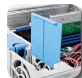
Air baffle to prevent air circulation