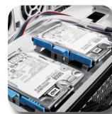
Tool-less 2.5" HDD mounting kit