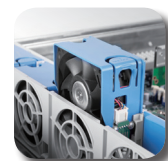
Hot-swap fan module