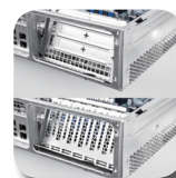
Easy-swap 3-slot or 7-slot rear window (Option)

※PSU ※ M/B Support ※ I/O Gasket ※ Air Duct ※ (Detailed in CHENBRO websites)