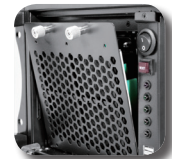
Easy-swap 1 x front 120mm fan with filter