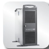
Stand-alone installation via optional kit