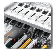
Tool-less adjustable card retainer for full height or low profile cards