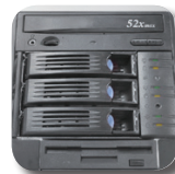
Rotatable cage for ODD or storage kits

※ PSU ※ M/B Support ※ I/O Gasket ※ Air Duct ※ (Detailed in CHENBRO websites)